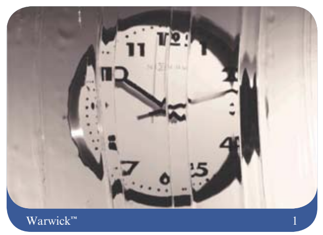
For important information on the use of this pattern please visit www.pilkington.co.uk/textureglass